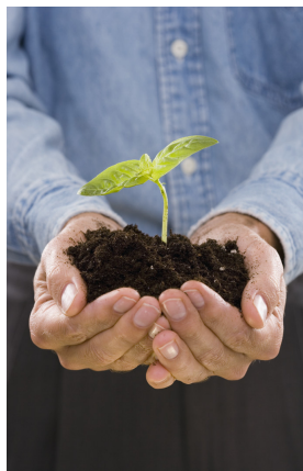
We're all hoping to find the "good soil."